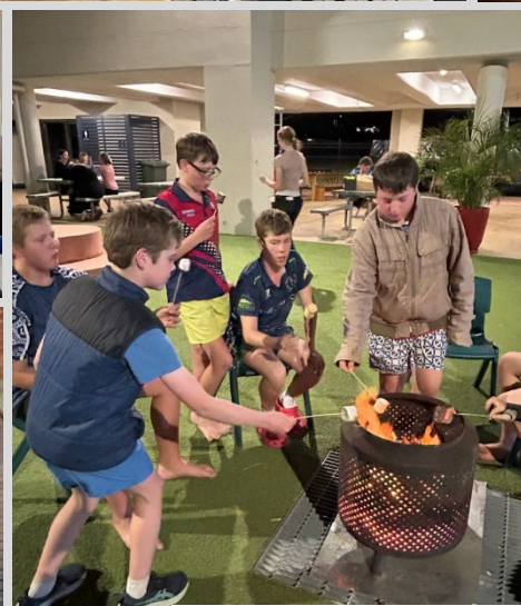
S' mores & Fire pit