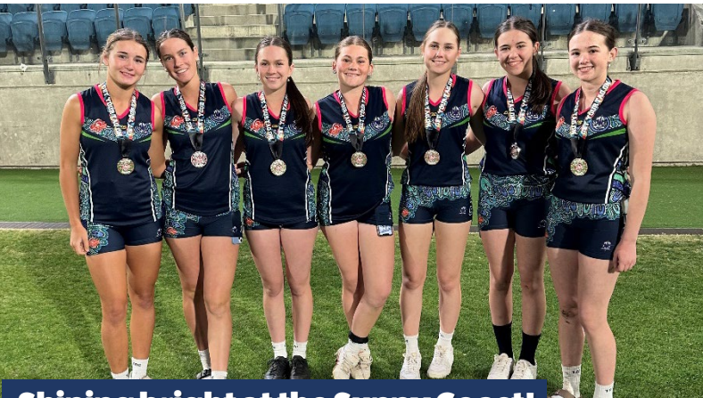
Shining bright at the Sunny Coast!